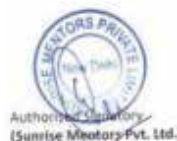
Authorised Signatory (Sunrise Mentors Pvt. Ltd.)