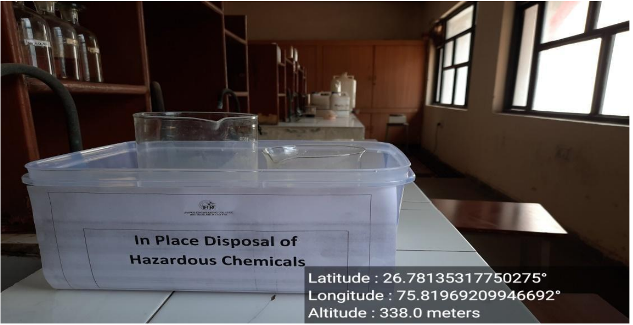
In Place Disposal of Hazardous Chemicals in Laboratories