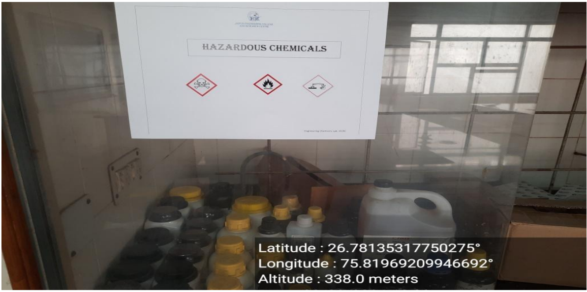
Separate Arrangement for Hazardous Chemicals in Laboratories

PRINCIPAL Jaipur Engineering College & Research Centre Tonk Road, Jaipur-302022