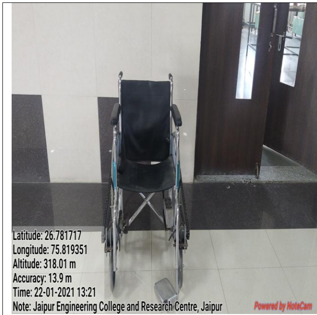
Disabled friendly washroom

Latitude: 26.781717 Longitude: 75.819351 Altitude: 318.01 m Accuracy: 13.9 m Time: 22-01-2021 13:21 Note: Jaipur Engineering College and Research Centre, Jaipur